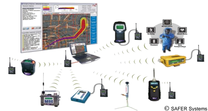
Figure 3: Mobile and ground-based input data-sources for source term back calculation

The ABC approach as implemented by Safer Systems ( www.safer-system.com ) is tested in the SkyObserver project using data measured with MAVs.