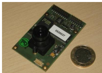
Figure 2: For the design of this person detection system it is necessary to process the data on-board the MAV in real-time, highly reducing the load for the radio transmission between the MAVs and the base station. Therefore a light-weight embedded vision system is required that comprises image acquisition as well as a processing platform. An embedded vision system that is highly amenable for our purpose is the VCSC4012nano, a so called "Smart Camera" from Vision Components.

The ground station serves as a configuration and parameterization, as well as for manual adaptation (by demand) of the system for the real time application.