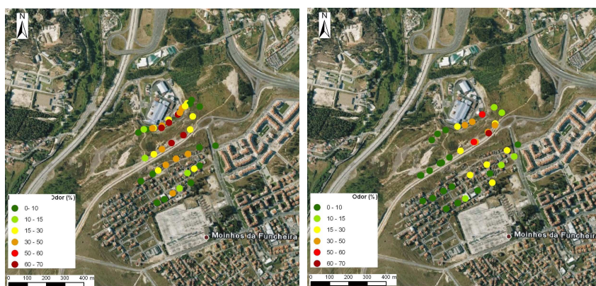
Figure 2. Odors perception frequency on September 11 th , 2008 (left) and September 12 th , 2008 (right).

Field inspections revealed an impact on local residents, which exceed the limit value of 10% of odors perception. Figure 2 shows that the odors frequency perception, from the operation of the Composting Plant, could get higher than 50%, south to the facility.