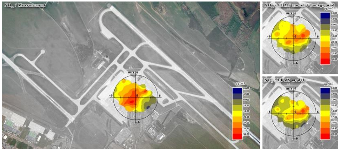
Figure 3. Pollution roses for measurement (left), EDMS + background (up, right) and EDMS (down, right) results of daily average \text{NO}_x concentration, at T2 site in 2012

In case of \text{PM}_{10} , whereas correlation coefficient show good agreement, a significant underestimation is demonstrated from statistical indicators, however apron area and passenger parking emission shows similar magnitude of emission in EDMS results, which corresponds to the reality. Although background values are determined with assumable uncertainty, the magnitude of \text{PM}_{10} concentrations is certainly underestimated by EDMS.